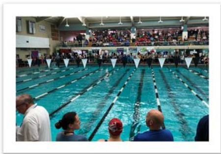
Class A Swim—Bowdoin College