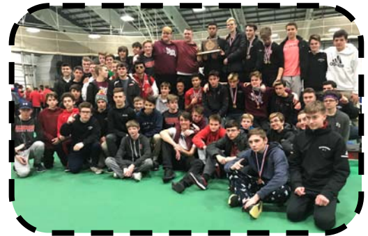
Class A Indoor Track