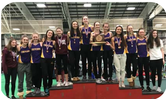
Class A Indoor Track ~ Cheverus High School